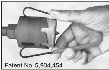
Patent No. 5,904,454